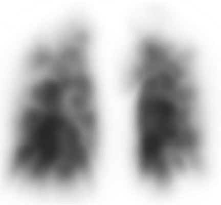
FIGURE 2: A lung perfusion scan showed multiple wedge-shaped perfusion defects in both lungs.

Following the diagnosis, the patient was treated with the anticoagulant warfarin, 1 course of chemotherapy with irinotecan (80 \text{mg}/\text{m}^2 on days 1, 8, and 15), and long-term oxygen therapy. Her shortness of breath upon exertion significantly improved initially; however, her respiratory condition gradually worsened, and follow-up CT scans showed multiple liver and bone metastatic lesions. Echocardiography indicated worsening pulmonary hypertension with tricuspid regurgitation, and the estimated gradient pressure was approximately