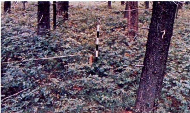
Photo 13. Green, low shrub fields within timber stands or without overstory are typical. Example is Douglas-fir-snowberry habitat type.