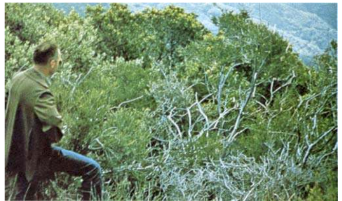
Photo 9. Mixed chaparral of southern California; note dead fuel component in branchwood.