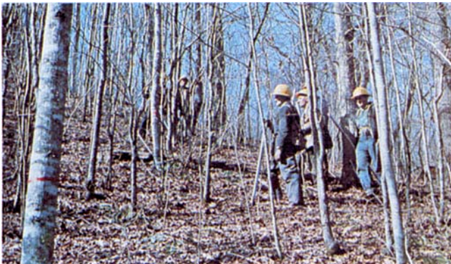
Photo 26. Loose hardwood litter under stands of oak, hickory, maple and other hardwood species of the East.