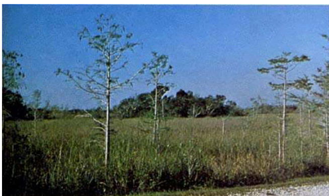
Photo 8. Sawgrass "prairie" and "strands" in the Everglades National Park, Fla.