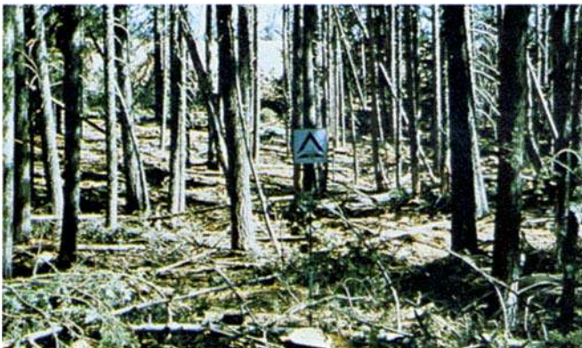
Photo 32. Mixed conifer partial cut slash residues may be similar to closed timber with down woody fuels.