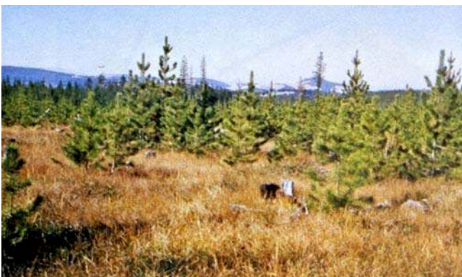
Photo 3. Open pine—grasslands on the Lewis and Clark National Forest.