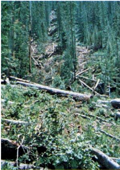
Photo 31. Slash residues left after skyline logging in western Montana.