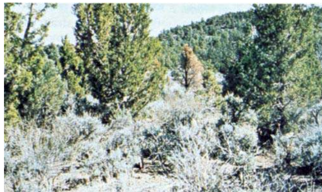
Photo 15. Pinion-juniper with sagebrush near Ely, Nev.; understory mainly sage with some grass intermixed.