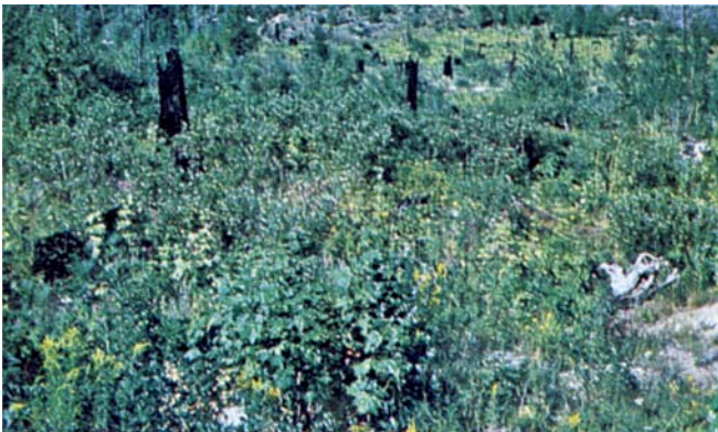
Photo 14. Regeneration shrublands after fire or other disturbances have a large green fuel component, Sundance Fire, Pack River Area, Idaho.