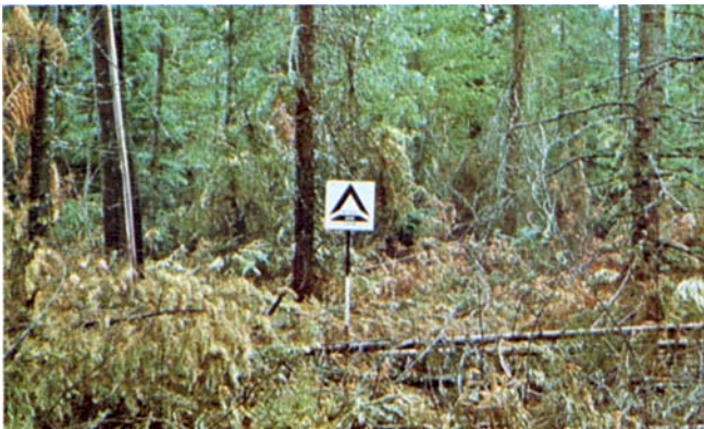
Photo 38. High productivity of cedar-fir stand can result in large quantities of slash with high fire potential.