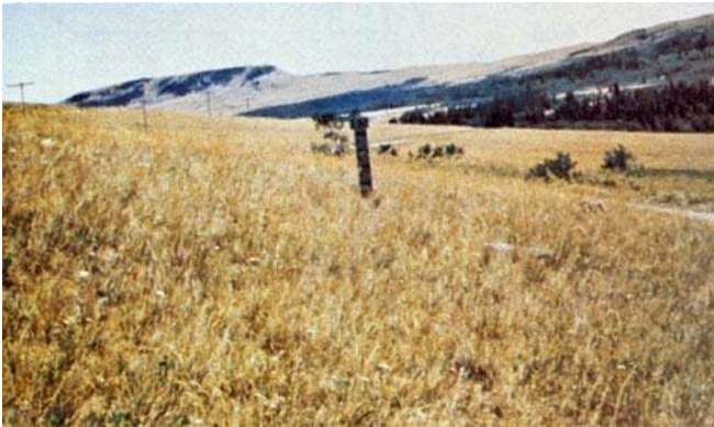
Photo 1. Western annual grasses such as cheatgrass, medusahead ryegrass, and fescues.