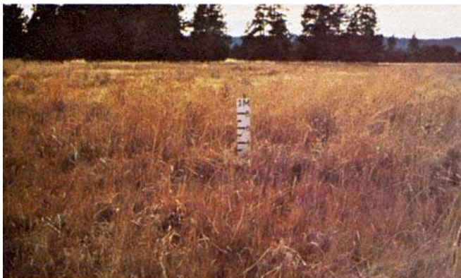
Photo 7. Meadow foxtail in Oregon prairie and meadowland.