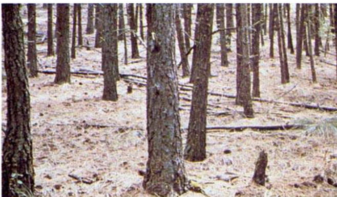
Photo 27. Long-needle forest floor litter in ponderosa pine stand near Alberton, Mont.

NFDRS fuel models E, P, and U are represented by this model. It is also a second choice for models C and S. Some of the possible field situations fitting this model are shown in photographs 25, 26, and 27.