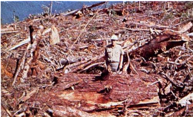
Photo 37. West coast Douglas-fir clear-cut, quality of cull high.