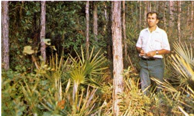
Photo 20. Southern rough with moderate to heavy palmetto-gallberry and other species.