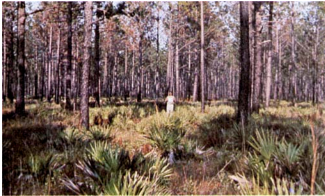
Photo 19. Southern rough with light to moderate palmetto understory.