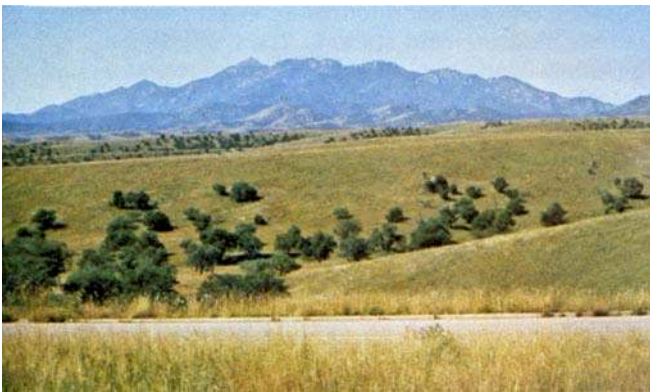
Photo 2. Live oak savanna of the Southwest on the Coronado National Forest.