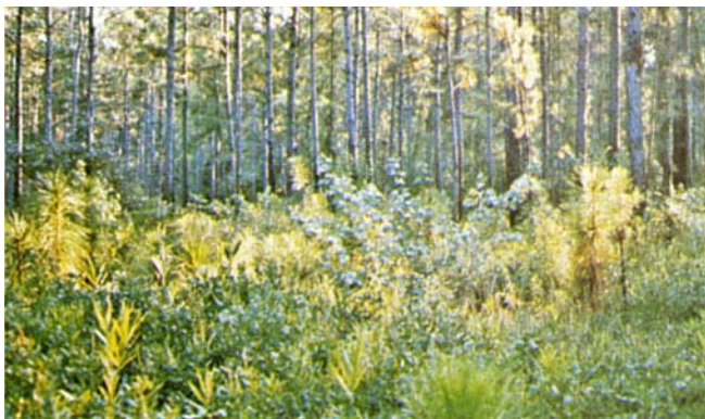
Photo 21. Slash pine with gallberry, bay, and other species of understory rough.