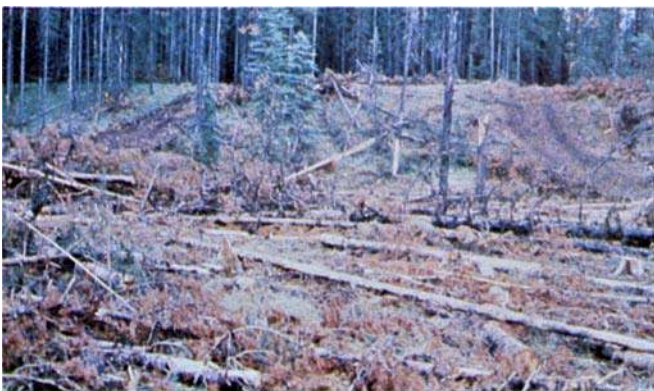
Photo 33. Light logging residues with patchy distribution seldom can develop high intensities.