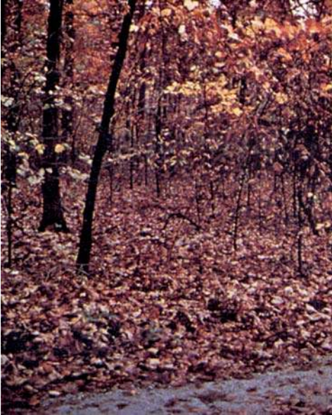
Photo 25. Western Oregon white oak fall litter; wind tumbled leaves may cause short-range spotting that may increase ROS above the predicted value.

Fires run through the surface litter faster than model 8 and have longer flame height. Both long-needle conifer stands and hardwood stands, especially the oak-hickory types, are typical. Fall fires in hardwoods are predictable, but high winds will actually cause higher rates of spread than predicted because of spotting caused by rolling and blowing leaves. Closed stands of long-needled pine like ponderosa, Jeffrey, and red pines, or southern pine plantations are grouped in this model. Concentrations of dead-down woody material will contribute to possible torching out of trees, spotting, and crowning.