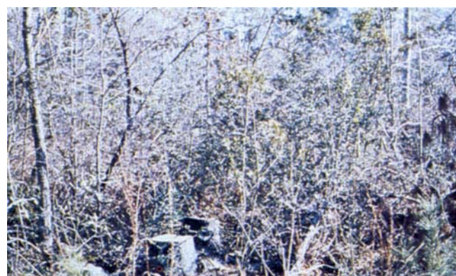
Photo 16. Southern hardwood shrub with pine slash residues.