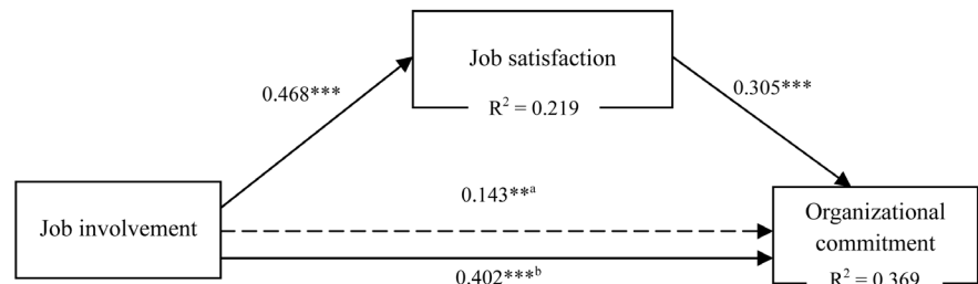
Figure 2. Job involvement-job satisfaction-organizational commitment model. Note: ***: p < 0.001 ; **: p < 0.01 ; a : indirect effect; b : direct effect.