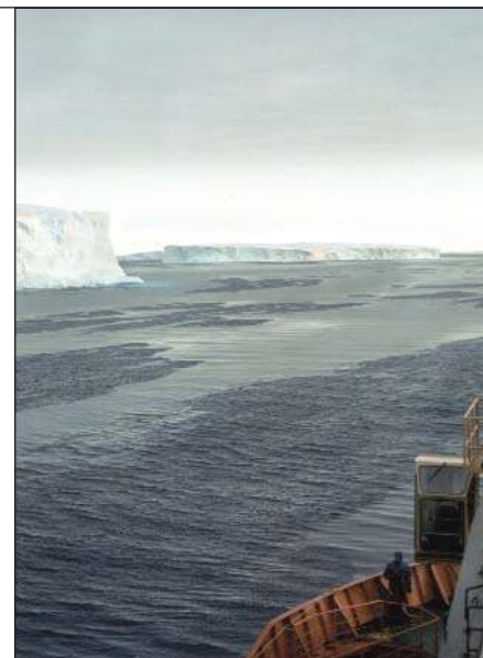
Exploring the Southern Ocean. The research and supply vessel Aurora Australis heads into an iceberg field off Antarctica.

In the Southern Ocean, there have been three open-ocean iron-enrichment experiments: SOIREE (Southern Ocean Iron Enrichment Experiment) (6), EisenEx-1 [Eisen(=Iron) Experiment] (7), and SOFeX (Southern Ocean Iron Experiment) (8). All three produced notable increases in biomass and associated decreases in dissolved inorganic carbon and macronutrients. However, evidence of sinking particles car-