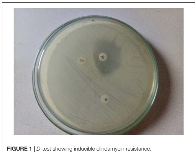
FIGURE 1 | D-test showing inducible clindamycin resistance.

whether the erythromycin resistant isolates expressed inducible clindamycin resistance. Briefly, the bacterial cells from the S. aureus isolates were diluted to 0.5 McFarland standard and spread over the Mueller Hinton agar (MHA) plate, on which erythromycin (15 \mu g) disk and clindamycin (2 \mu g) disk were placed 15–26 mm edge to edge apart. The plates were incubated at 35°C for 16–18 h in aerobic condition. Flattening of the zone of inhibition of clindamycin adjacent to the erythromycin disk was regarded as D-test positive ( Figure 1 ).