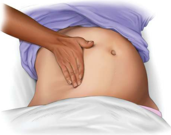
Figure 3. Left uterine displacement using 1-handed technique.

Chest compressions should be performed slightly higher on the sternum than normally recommended to adjust for the elevation