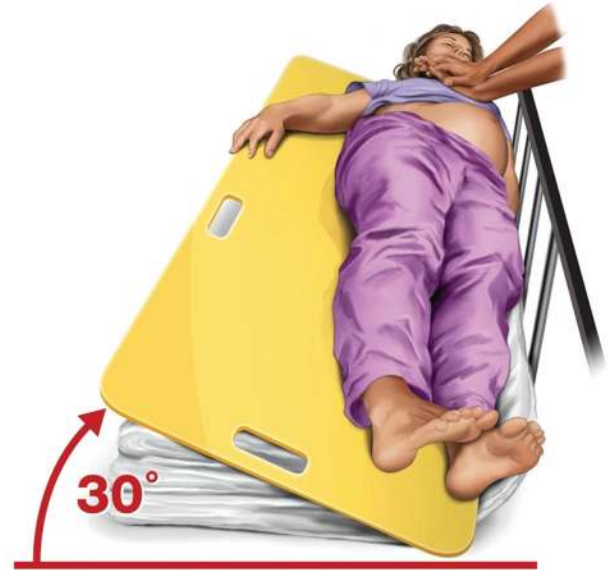
Figure 4. Patient in a 30° left-lateral tilt using a firm wedge to support pelvis and thorax.

of the diaphragm and abdominal contents caused by the gravid uterus.