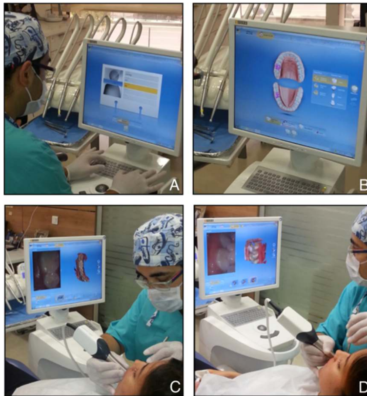
Figure 2 Digital impression technique. A) Entering patient information, B) Laboratory prescription, C) Upper and lower arches scanning, D) Bite scanning.

significantly different ( p < 0.001 ), and comparison of the mean impression times indicated a statistically significant difference ( p < 0.001 ). The mean tray selection time for the conventional impression technique and the mean time for entering patient information for the digital impression technique were not statistically significant ( p > 0.05 ). The mean adhesive application time for the conventional impression technique was statistically significantly different ( p < 0.001 ) from the mean time for entering the laboratory prescription time for the digital impression technique. The difference between the mean bite registration time for the conventional technique and the mean bite scan time for the digital technique was statistically significant ( p < 0.001 ).