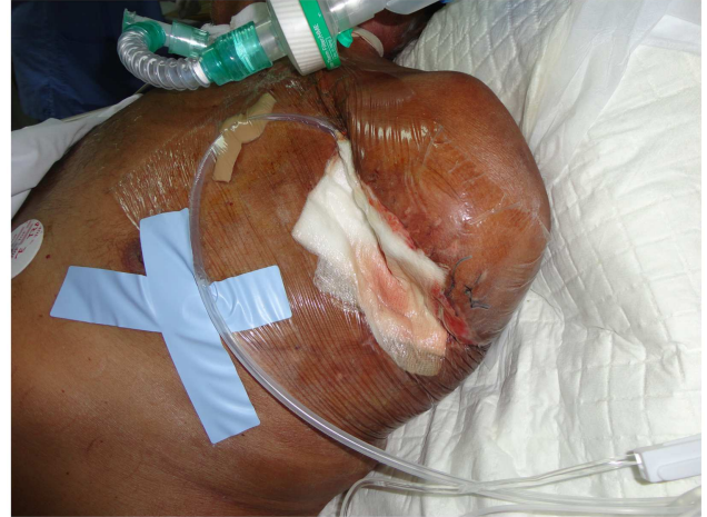
FIGURE 3 | After surgical debridement, the use of the VAC system helps wound healing by absorbing excess exudates; reducing localized edema, and finally drawing wound edges together.

Lately, many surgeons worldwide have started using vacuum-assisted closure (VAC) therapy for fast and effective wound closure