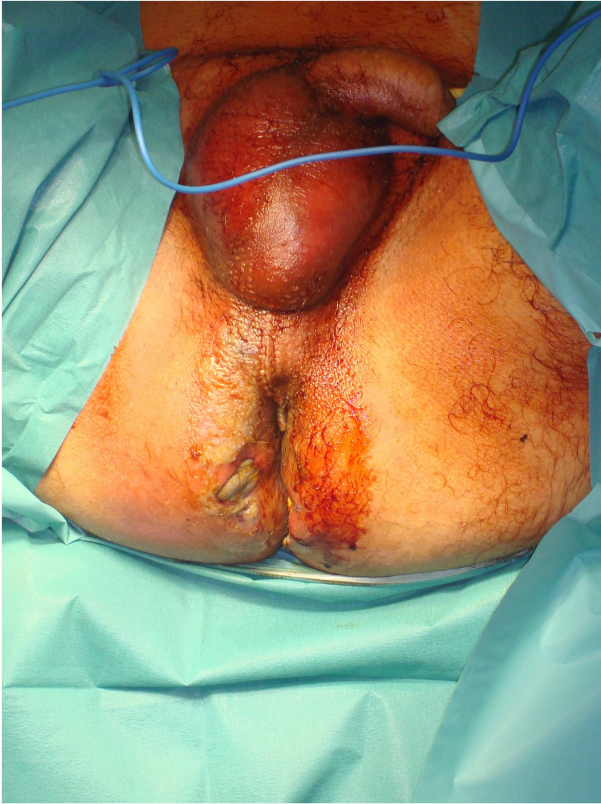
FIGURE 2 | A severe case of Fournier's gangrene with excessive erythema and edema in the perineal and gluteal regions as well as skin necrosis with bullae.

(toxic or cardiogenic) requiring treatment with more than one inotrope. Furthermore, concurrent vascular insufficiency further increases the need for amputation, especially when the patient is diabetic. Amputation is usually considered as a shorter procedure associated with less blood loss than a radical debridement. This explains why patients with hypotension and shock are best treated with amputation, as they cannot endure additional protracted operations. Studies have proved that, although amputation is not seen to reduce mortality, patients undergoing this procedure required fewer repeat operations, which is extremely important for patients presenting severe co-morbidities or a fulminant form of NF (74).