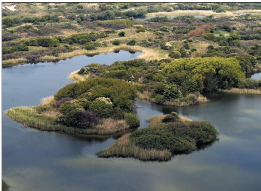
Figure 1. Artificial lakes covering coastal dunes represent ecologically designed systems to provide drinking water for large cities in the Netherlands.

There is a pressing need for further collaborations between ecologists and corporations, governmental agencies, and advocacy groups, at local and international levels. Business practices have substantial impacts on the environment, but if informed by ecological knowledge,