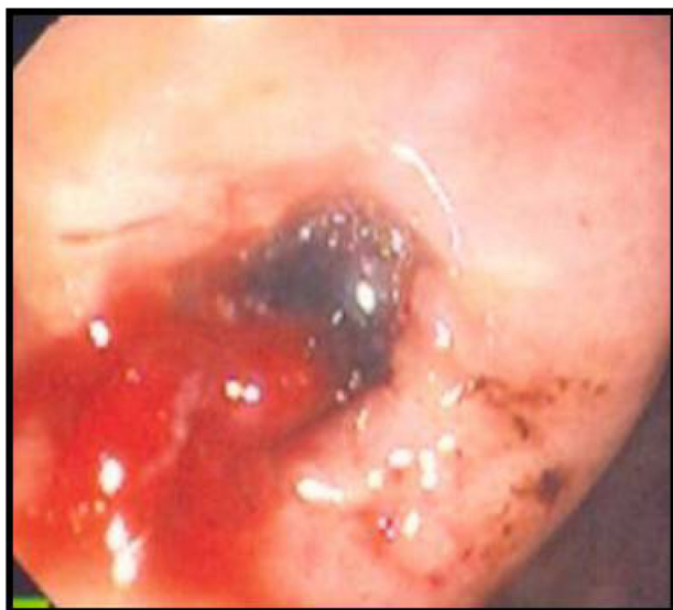
Figure 1 Endoscopic image of a 1×1 cm hemorrhagic gastric ulcer in the antrum with a visible vessel revealed by endoscopy.

Note: Endoscopy is from a 53-year-old woman presenting to the emergency department following two bouts of hematemesis and a melanic stool.