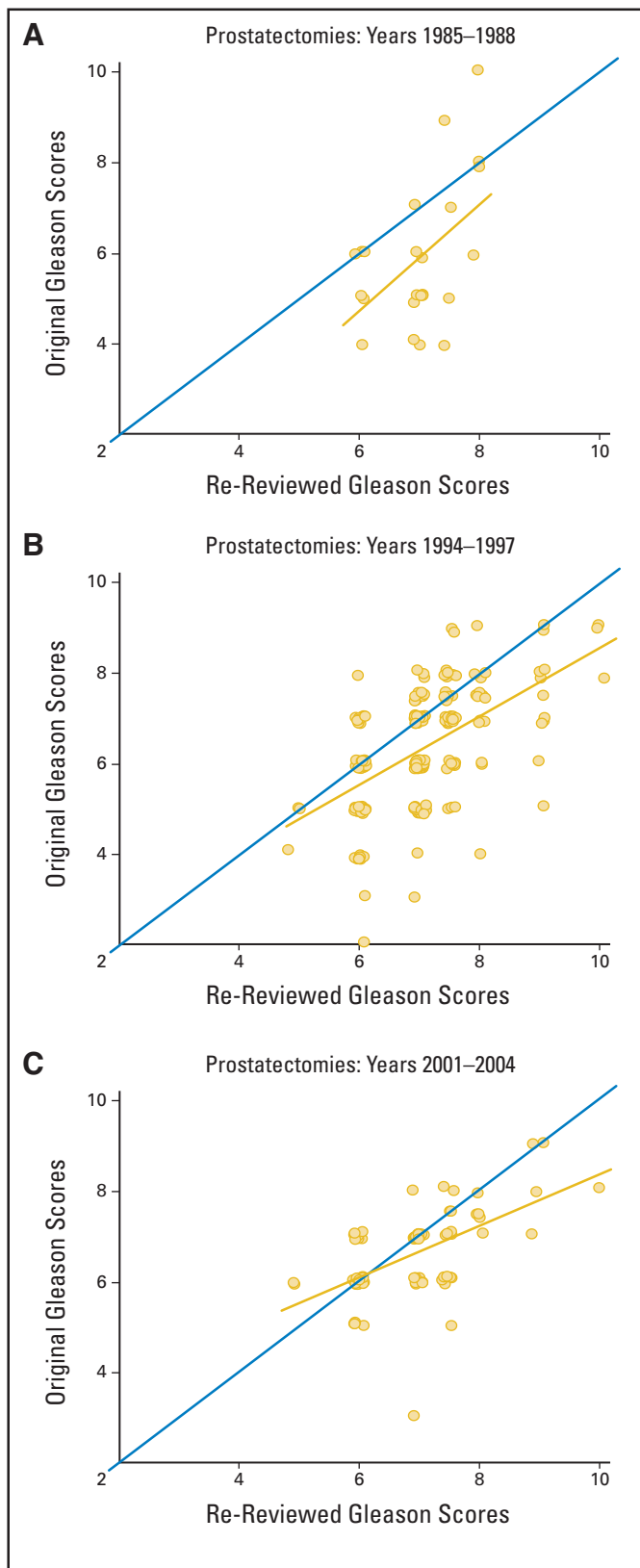
Fig 1. Comparison of standardized and original Gleason scores assigned to prostatectomy specimens during three time periods. The Gleason scores and the best fitting line through the points are plotted in gold. The blue line represents perfect concordance between original and standardized scores.

14.0 for GS 2 to 5, 8.5 for GS 6, 10.8 for GS 3 + 4, 45.2 for GS 4 + 3, 26.6 for GS 8, and 15.9 for GS 9 to 10.