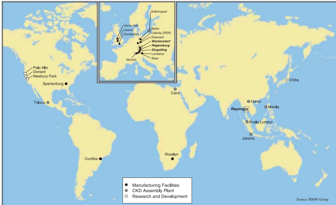
Figure 2 Global locations of BMW group

other firms in the sector, BMW has some specific characteristics that distinguish it from other car manufacturers. As a niche producer for the upmarket and luxury markets, the BMW Group has relatively low production volumes and thus the global production network strategy is to some extent different from that of the mass manufacturers. Also, the company has a very strong base in Bavaria and is approximately 47 per cent owned by members of the Quandt family. This shareholding structure has a decisive impact on inter-firm relationships within BMW's global production network.