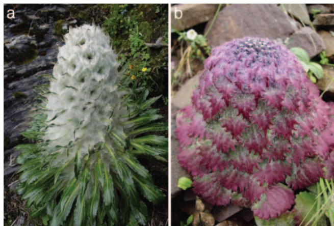
Fig. 1. Snow lotus used in traditional Tibetan and Chinese medicine. Shown are S. laniceps (a), the preferred species, and S. medusa (b), which is seldom collected or marketed.

Saussurea laniceps and Saussurea medusa (Asteraceae), known collectively as snow lotus (Fig. 1), are endemic to the eastern Himalayas. Both species have limited distributions on rocky habitats >4,000 m. Snow lotus is used in traditional Chinese and Tibetan medicine for the treatment of headaches and high blood pressure and to regulate menstrual cycles and treat menstrual problems (18). Although S. laniceps are primarily harvested as medicinal plants, they also have become popular souvenir items with tourists because they are strange-looking, rare, and grow in exotic locations (19). S. medusa are smaller and less frequently collected for medicine, sale, or souvenir. Larger individuals of S. laniceps are preferentially collected, because these are thought to be more potent and efficacious. Further, larger plants are easier to find. Regrettably, the whole plant of this monocarpic, long-lived species is harvested during the final flowering period, just