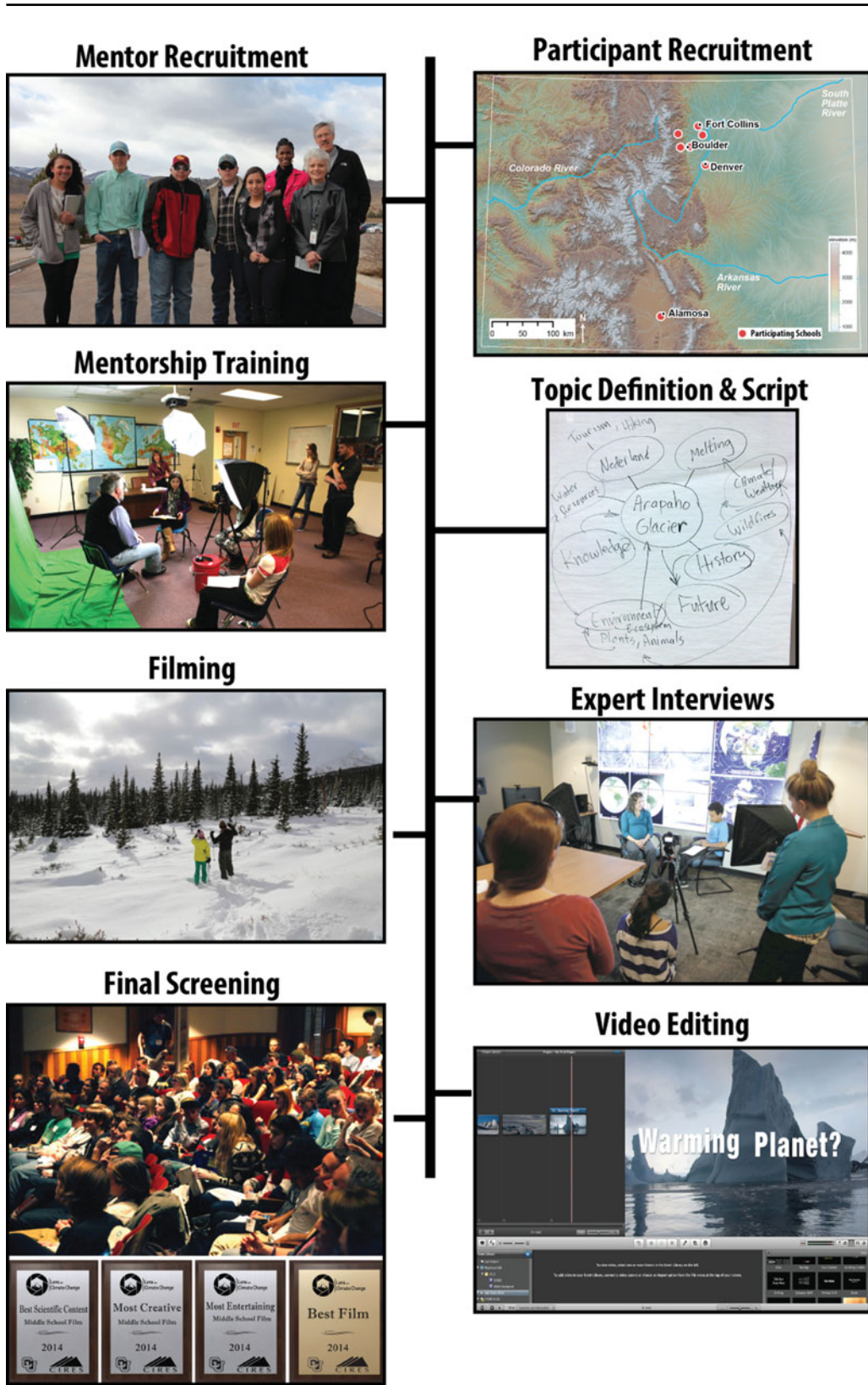
Figure 1. Schematic overview of the Lens on Climate Change program structure. (Color figure available online.)