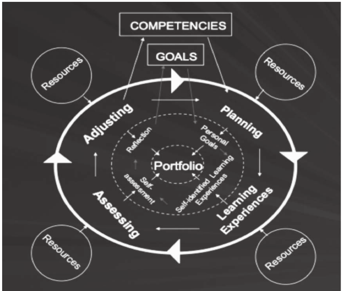
Figure 1 44

The student portfolio will be supported by a range of online technology that is already being used to support self-directed learning and enhance traditional face-to-face classes. Among the initiatives under way at UMMS are the following: