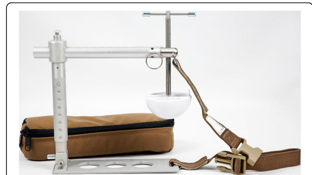
Fig. 1 CRoC™. https://combatmedicalsystems.wordpress.com/2013/05/06/combat-ready-clamp-croctm-makes-tactical-medicine-history/

The CRoC™ has been FDA-cleared for axillary haemorrhage and has shown to be effective in a cadaver model [37]. It is a device which consists of a stamp compressing the targeted area underneath. See Fig. 1. It has been