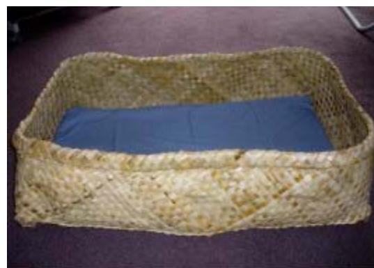
Fig. (2). Wahakura, as used by the Maori (indigenous) communities in New Zealand.

Several communities are re-introducing traditional infant sleep areas as a strategy to increase safety when infants sleep in their parents' beds. In New Zealand, where SUID rates are among the highest for developed countries [8], indigenous SUID rates are more than 4 times those in the European population [50], and deaths associated with bedsharing are common [50], two traditional sleep spaces have been introduced. The wahakura, which is a low-sided (6 inches tall) infant bed woven from flax, was traditionally used in the Maori (indigenous) communities (Fig. 2) and has been actively reintroduced and promoted. It is meant to be used wherever the infant sleeps, but is usually placed in the adult bed next to the parent as a separate infant sleep space within the adult bed. Preliminary results from a randomized controlled trial [51] suggest that rates of use, quantity and quality of maternal sleep, breastfeeding, and head covering