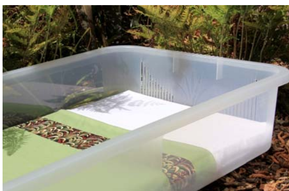
Fig. (3). New Zealand pēpi-pod.

events are similar for the wahakura and a standard bassinet placed next to the parents' bed or in the parents' room. A similar New Zealand product is the pēpi-pod ("pēpi" is the Maori word for "baby"), a portable plastic container fitted with a firm mattress and used as an infant bed that, like the wahakura, can be placed on the adult bed next to a parent (Fig. 3). The pēpi-pod was originally introduced as an emergency infant bed after the 2011 Christchurch earthquakes [52]. The wahakura and pēpi-pod are part of a national education program in New Zealand that promotes safe sleep among families at high risk for SUID. The program has been adopted by district health boards as a targeted approach for reducing sudden infant deaths and promoting infant health, especially in regions of New Zealand with more vulnerable populations. Receiving a portable sleep space comes with an expectation that recipients help spread awareness about safe sleep to others, and this has stimulated conversations about safe sleep within the local communities. There is some indication that there is a greater reduction in SUIDs in District health boards with pēpi-pod and wahakura programs, compared with those without such programs [53].