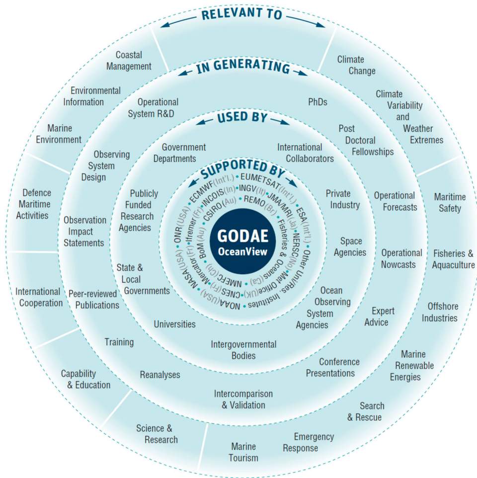
Figure 1. ‘Circle diagram’ (read from inside to out) illustrating how GOV links with the entire maritime sector, to generate scientific outputs that deliver benefits across all relevant sectors of global economy, society and environment. Abbreviations in parenthesis behind supporting institutions: Int’l = international, It = Italy, JA = Japan, No = Norway, Fr = France, In = India, Br = Brazil, Ca = Canada, Ch = China, Au= Australia.

biases in the forecasts of temperatures and improve the predictions of near-surface currents. Not surprisingly, this is an active area of research using field studies and large eddy simulations to develop improved parameterizations (McWilliams and Danabasoglu 2002; Molemaker et al. 2010). Coupled atmosphere–wave–ocean models will allow more complete representation of these processes, provided the models have sufficient spatial and temporal resolution to resolve them. Improved parameterization of other sub-grid scale processes such as the breaking of internal gravity waves could also be important (Liang and Thurnherr 2012). Improved treatment of the grid-scale closure in high-resolution models (e.g. the two-dimensional dissipation of enstrophy cascading to smaller grid-scales and the transfer of energy towards larger scales) may also be important; the original formulation of the Gent-McWilliams (Gent et al. 1995) scheme seems a less satisfactory solution to this issue in eddy-resolving models than coarse resolution ones.