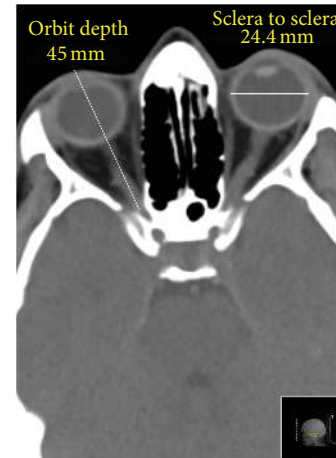
FIGURE 1: The retina to retina transverse diameter of the eye measured by computed tomography.

Exclusion procedure was organized in two steps. First, the patients with documented ophthalmologic or neuroophthalmologic disorders were excluded as well as patients with injuries around the eyeballs and the orbits. Second, the selected patients were examined by an ophthalmologist to exclude overlooked eye disorders including squint, exophthalmos, and astigmatism. After that, the selected patients were divided into three refraction groups: (I) patients with myopia ( n = 56 ), (II) patients with emmetropia ( n = 118 ),