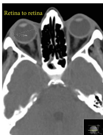
FIGURE 2: The cornea to optic canal anterior opening depth of the orbit and the sclera to sclera diameter of the eyeball.

and basic descriptive statistics (mean, standard deviation (SD), min, and max) were calculated for every variable (three eyeball diameters, three orbit measurements). The data obtained from the left eye and from the right eye were compared. The correlation analysis was performed with the following variables: orbit size, gender, age group (group (I): 18–30; group (II): 30–65; group (III): 65+), and ethnic background. The data were statistically evaluated by three-dimensional analysis of variance, SPSS, Standard version 17.0 (SPSS, Chicago, IL, 2007), and correlations were evaluated with \chi^2 criterion using 95% confidence interval. The level of significance for all analyses was set at P < 0.05 .