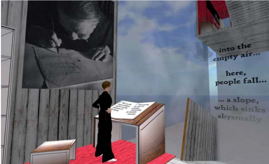
Fig. 1: An avatar audience member browses through a book in Void Projects' Babble .