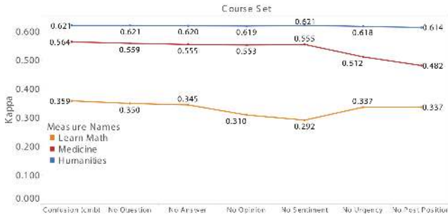
Figure 3: Ablative Analysis, Kappas. No Question is the combined classifier without the question constituent; No Answer is No Question without the answer constituent; and so on.

informative feature in the Managing Emergencies course.)